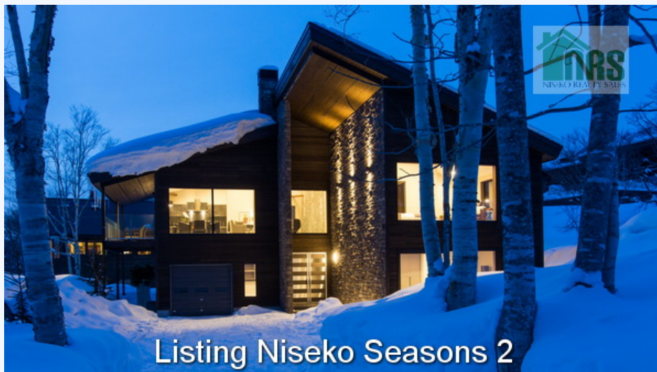
Listing Niseko Seasons 2