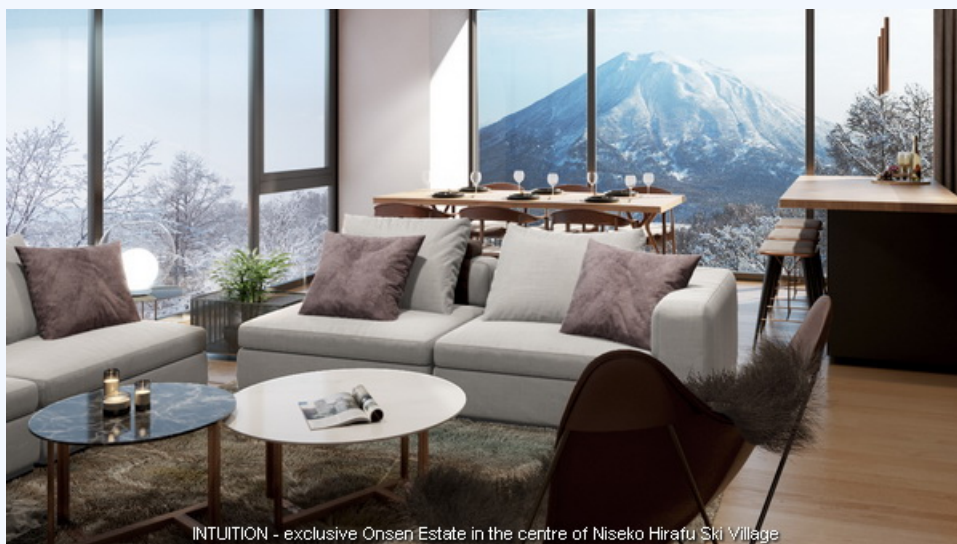
INTUITION - exclusive Onsen Estate in the centre of Niseko Hirafu Ski Village