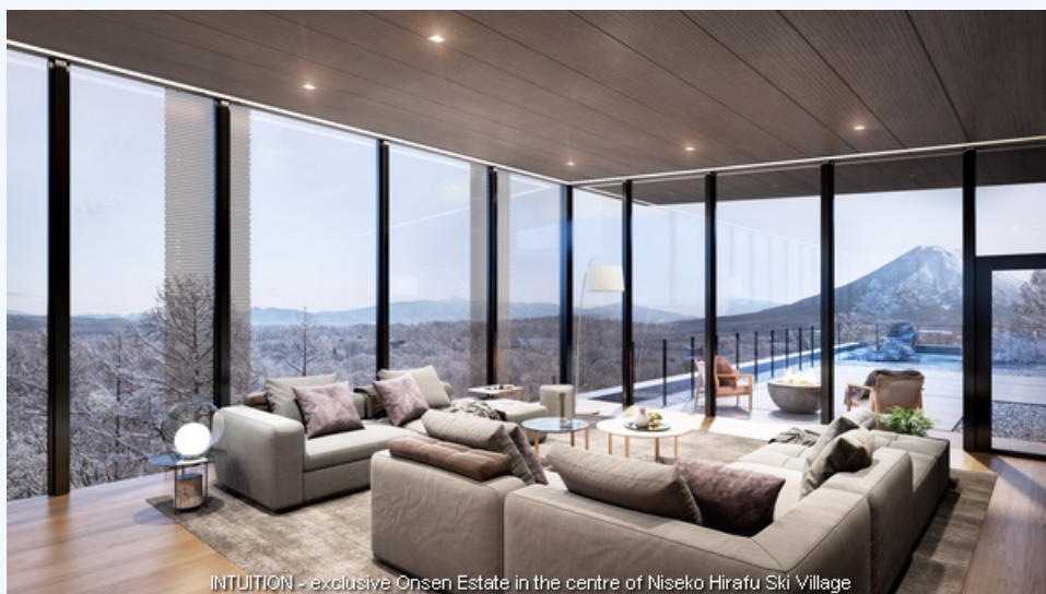
INTUITION - exclusive Onsen Estate in the centre of Niseko Hirafu Ski Village